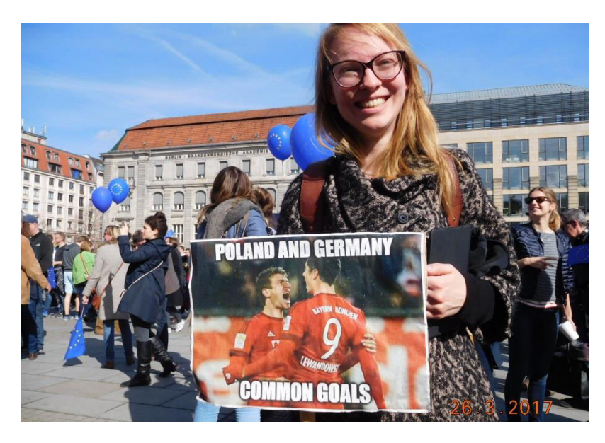
Picture from a rally of the initiative: "Pulse of Europe" on the Berlin Gendarmenmarkt - for a young Polish woman, reconciliation between neighbouring countries is important. Others plead for love as a binding force in the European Union.