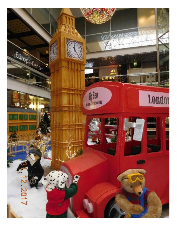
is the shopping centre "Europa Center" in Berlin-Charlottenburg at the turn of the year, with an exhibition of sights from the major European cities such as London and Athens.

Only a few steps further, at the Gedächtniskirche, a year after the terrorist attack on the Christmas market, many Berliners and guests pause in memory of the victims and their relatives.