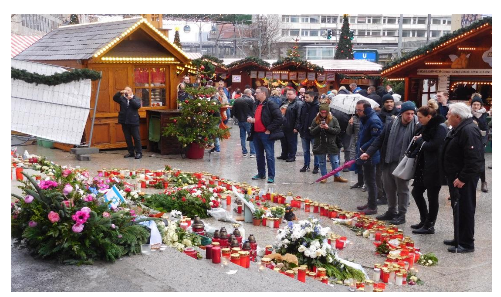
Here are flowers from the European Seniors' Union also

Only a few steps further, at the Gedächtniskirche, a year after the terrorist attack on the Christmas market, many Berliners and guests pause in memory of the victims and their relatives.