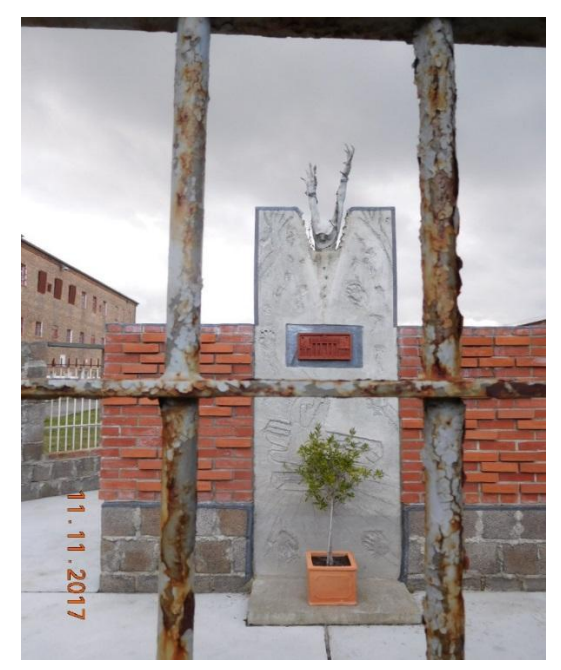
In Gębice, formerly Amtitz (voivodship Lubusz, Poland), one is reminded of the first internment camps of the Nazis after the beginning of the war in 1939, where also Father Maximilian Kolbe was temporarily imprisoned (picture left). In the grounds of the Zuchthaus Cottbus (DE) memorial site, a former political prisoner from the GDR time created a memorial for the dead at the Berlin Wall. In Cottbus, political prisoners of both German dictatorships were confined.