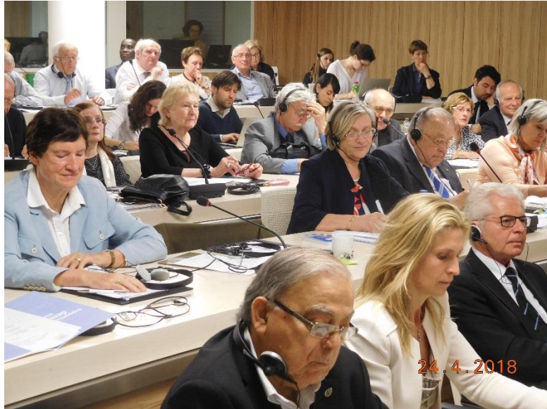
View of the meeting room in the Kartuizercenter in Brussels

She argued for the introduction of “civic education” as a school subject and presented the new “European Citizens’ Initiative”. Lifelong learning and public meetings would help bring young people to the polls, according to the young woman.