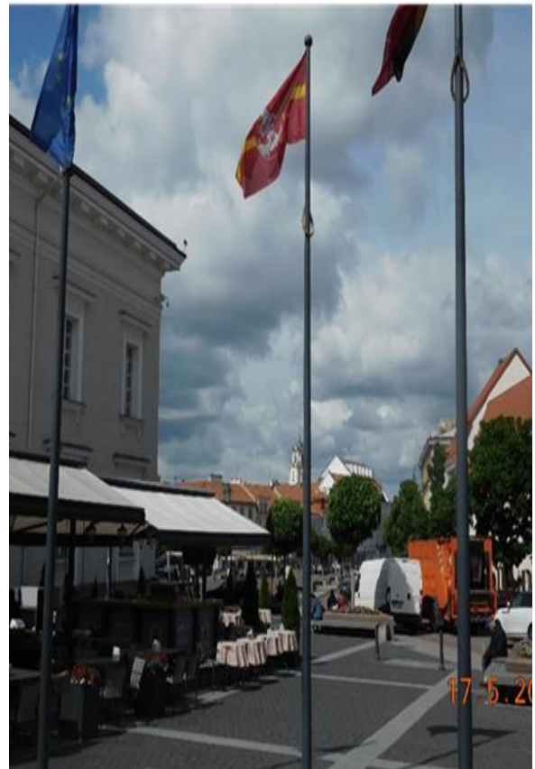
The European flag also in front of the Town Hall