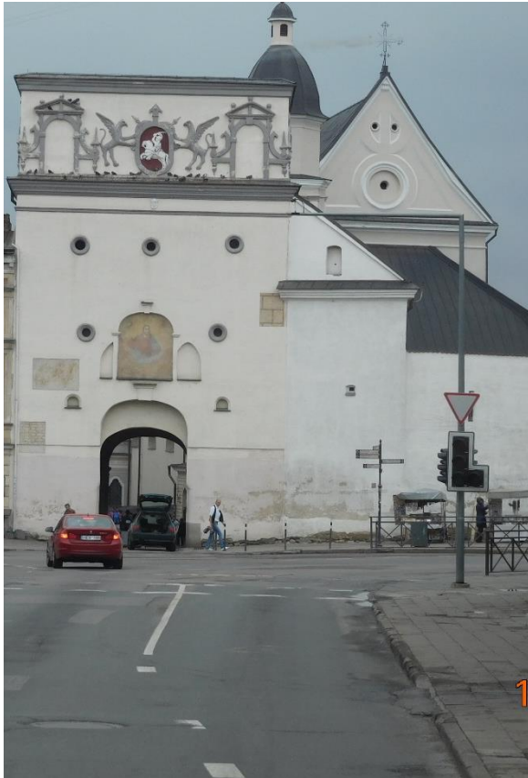
The Gates of Dawn