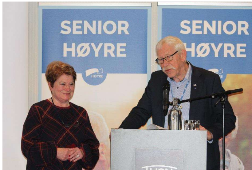
The new chairman with the ESU President

Prague, he introduced himself meanwhile as a new member of the Executive Committee of the ESU.