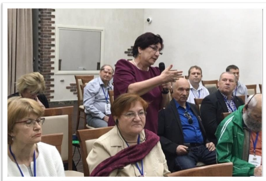
The country presentations are being questioned

In this, the "1st Forum" of its kind, according to the view of the manager and her team, the situation of older citizens in each country should be discussed. And so it came gushing out of the mouths of the speakers of eleven organizations and associations, just as if they had long been waiting for this opportunity. Embedded in the presentation of their homelands - historically, geographically, administratively, ethnically and sometimes politically - it became quite specific.