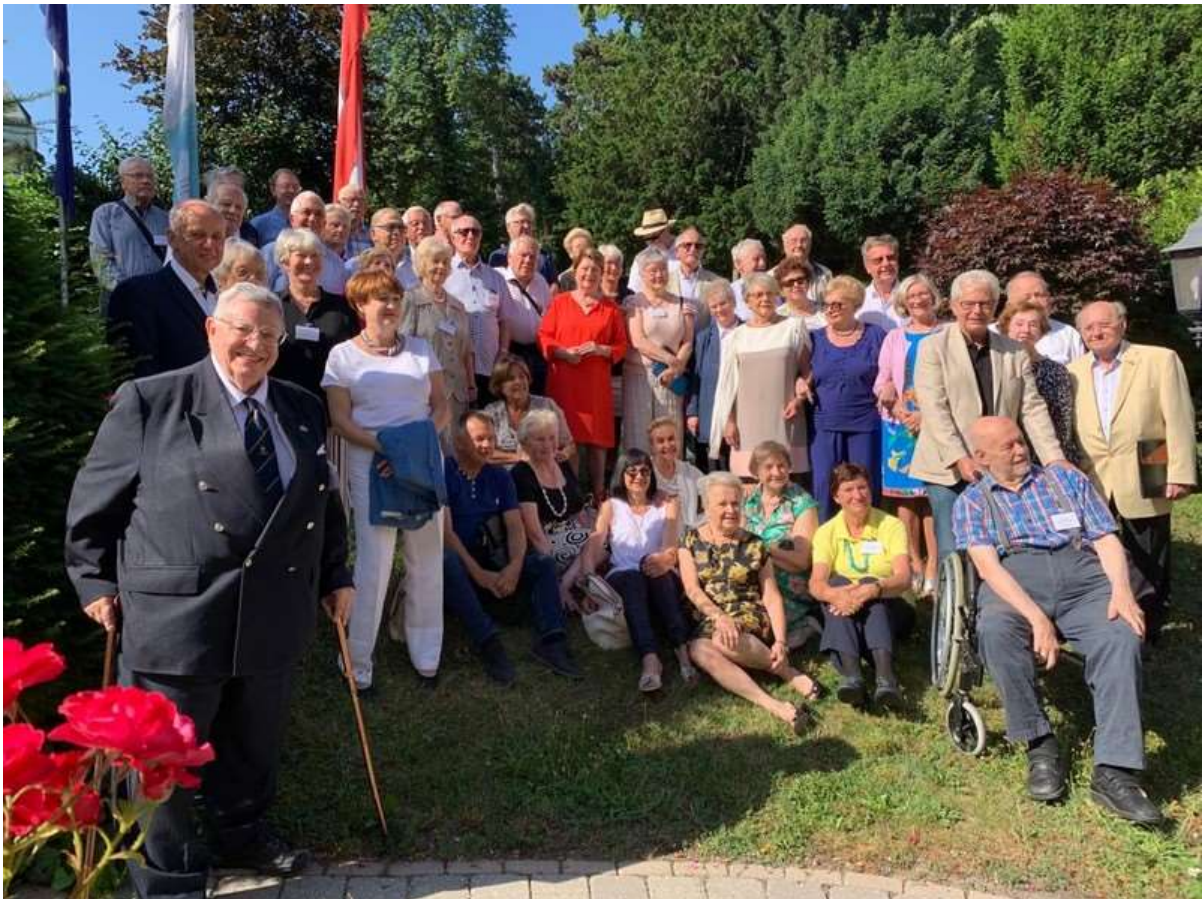
The external lecturers are missing from the “family photo” of the Summer Academy